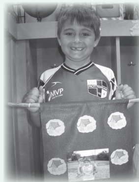
A Fun Combination: A student shows off the merit badges he earned during a camp for students who will be in a combined first- and second-grade class next year.

For more information about a combined classroom, visit the district Web site.