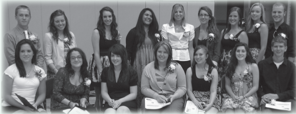
Schalmont Top Scholars: The 20 seniors in the top 10 percent of the Class of 2010 all had more than a 94 percent grade point average.

and Class Council. This year she was the class treasurer, secretary of the National Honor Society and English Honor Society, co-editor of the newspaper, and captain of the Girls Varsity Basketball Team.